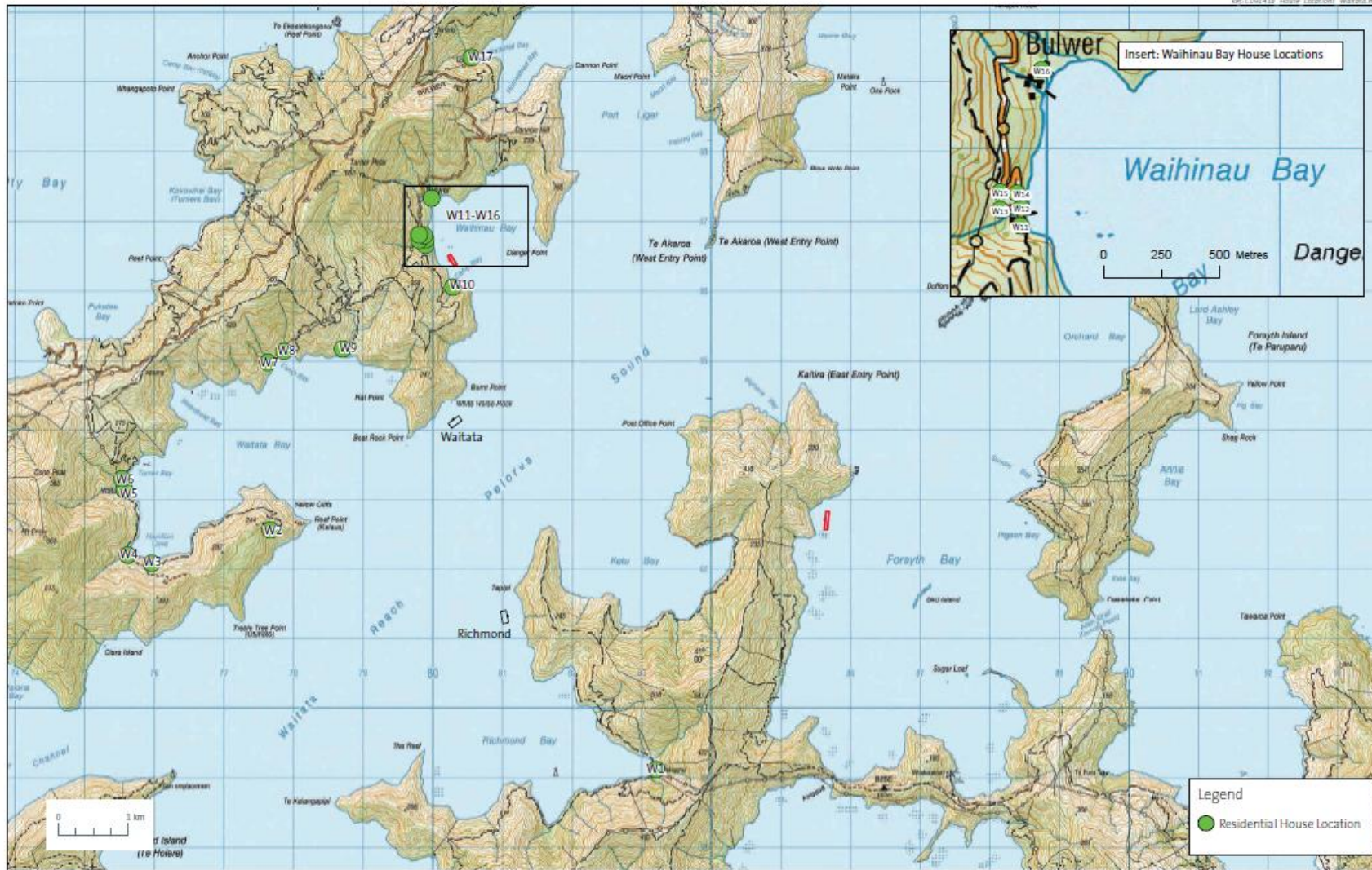
WAITATA REACH GROUP